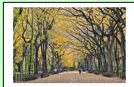
Cynthia Fleury - Literary Walkway Central Park